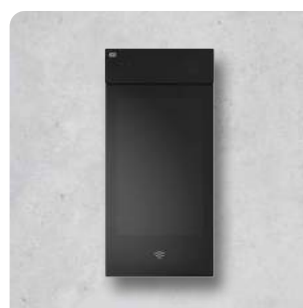
2N® IP STYLE (SUPPORTS SECURED CARDS) 9157101-S